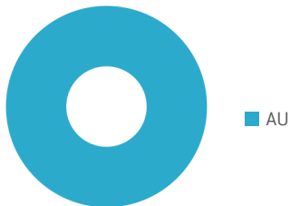
COUNTRY WEIGHTINGS INCL. NON-LOCAL*