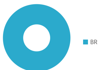
COUNTRY WEIGHTINGS INCL. NON-LOCAL*